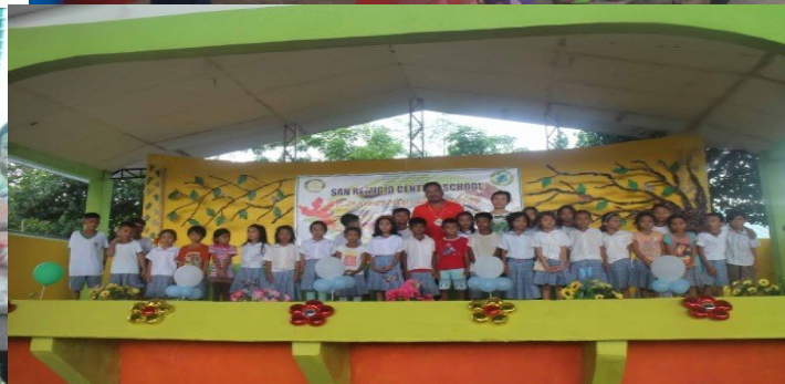
Children this year who are benefitting the feeding program